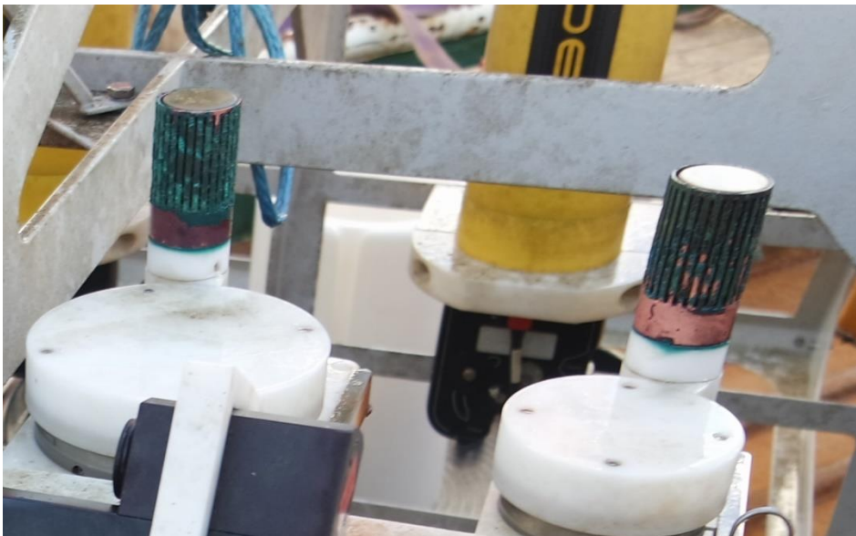
Figure R2: Filter and pump intake for the two CONTROS sensors from O246 directly after retrieval.